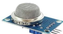
Figure 2. Air Quality Sensor

The proposed system consists of several IoT-enabled sensors, including air quality sensors (e.g., PM2.5, CO2), water quality sensors (e.g., pH, turbidity), and environmental sensors (e.g., temperature, humidity). Microcontrollers such as ESP32 and Raspberry Pi serve as the central processing units, while communication modules (Wi-Fi, LoRa, GSM) facilitate data transmission. A power management system utilizing solar energy and battery backup ensures sustainability and continuous operation [7], [13].